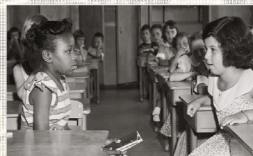
Brown v. Board of Education